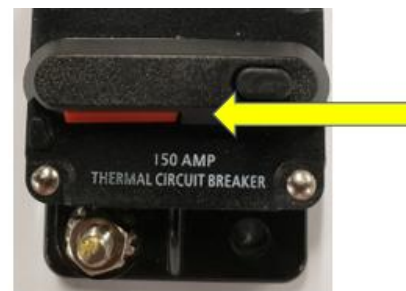
Figure 2: Bad Circuit Breaker with RED arm

Please arrange to take your motorhome to a reputable service center OR dealer of your choice to have the correction completed. A list of Tiffin Motorhomes authorized dealers is available online at https://tiffinmotorhomes.com/service-