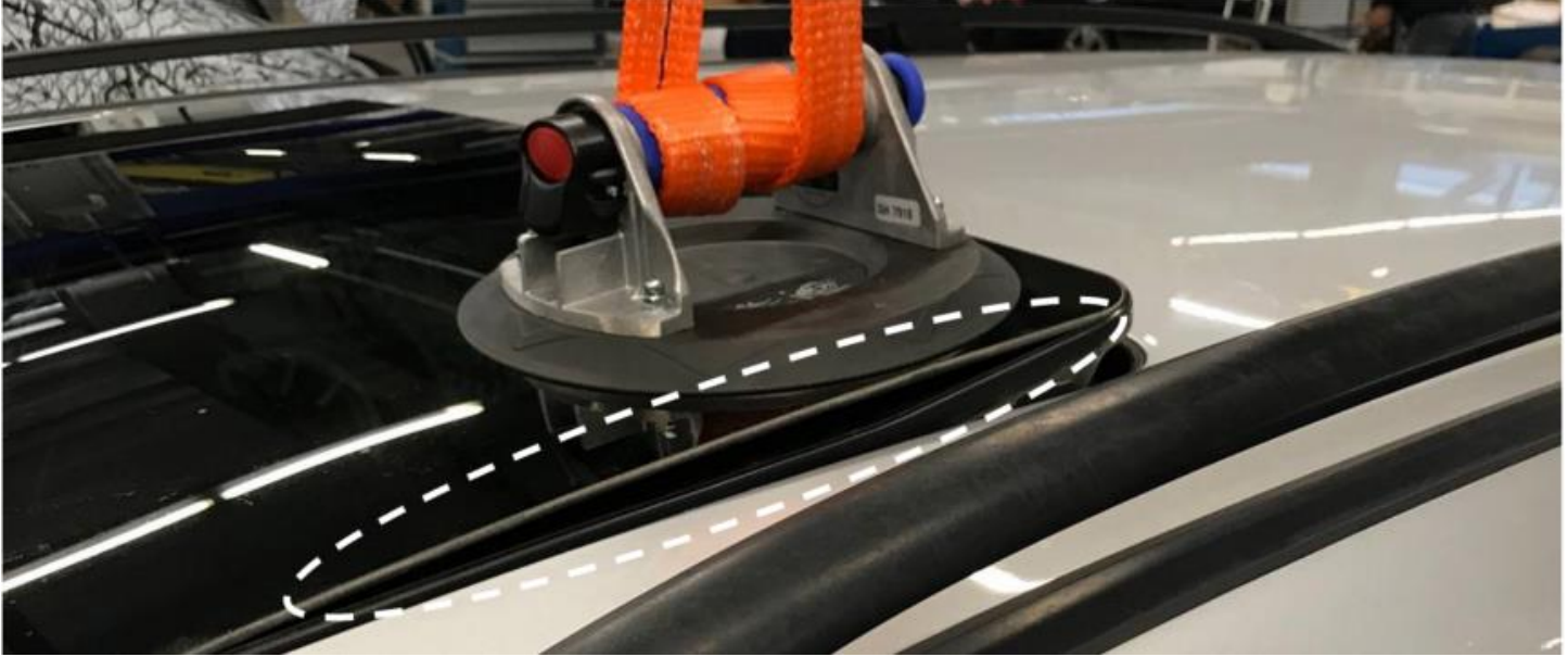
Figure 3, not OK (shown here on a sliding sunroof)

i If the panoramic sliding sunroof panel is detached from the padding of the sliding sunroof/ tilting roof frame at one of the test points (see Figure 3), replace the sliding sunroof panel.