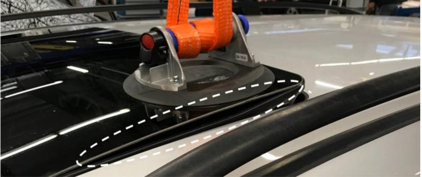
Figure 5, not OK (shown on an SHD)

i If the panoramic sliding sunroof panel detaches from the padding of the tilting/sliding sunroof frame at one of the test positions (see Figure 5), the glass cover must be replaced.