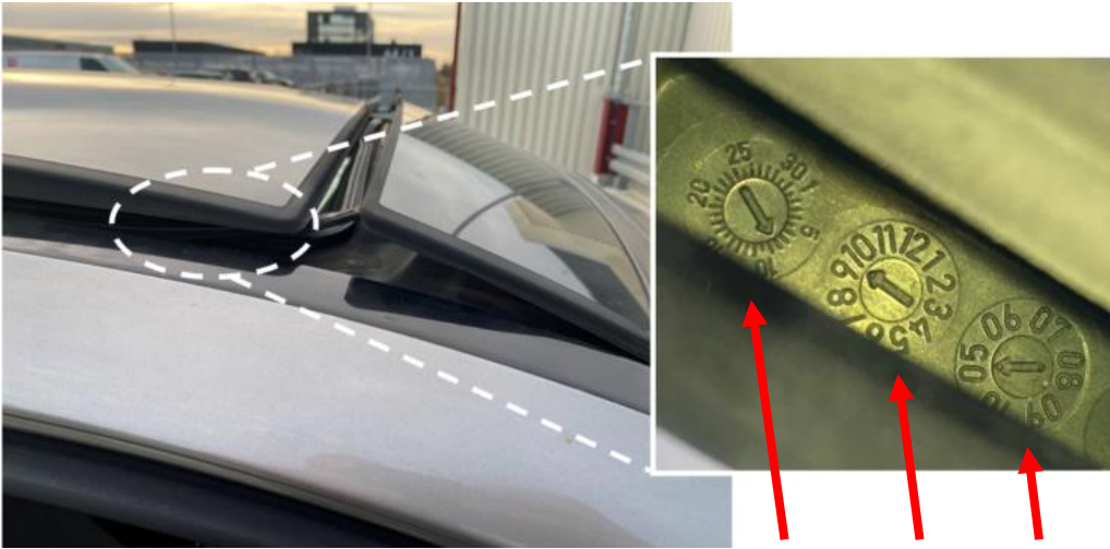
Figure 1 (The manufacturing date in the sample picture is 08 day / 10 month / 5 year) (10/08/2005)

i Vehicles with a registration date that does not match with the manufacturing date of the panoramic sliding sunroof can also be affected.