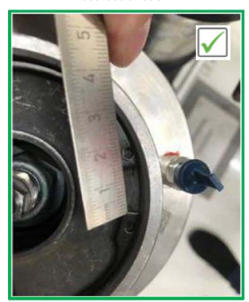
Test result OK.