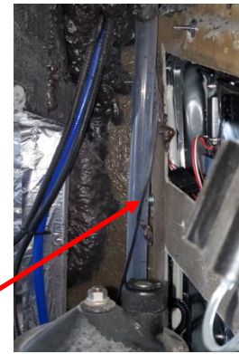
Air Intake Box Drains