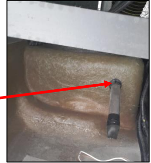
Air Intake Box Drain