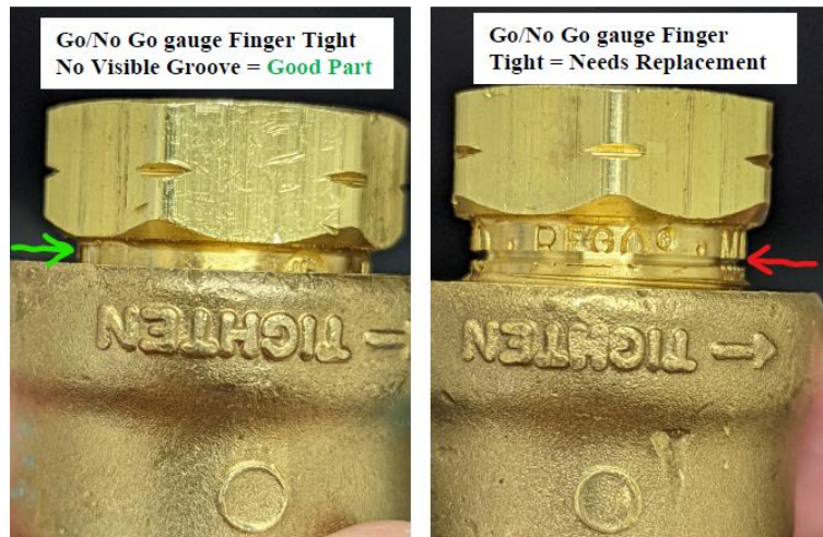
Figure 4 LPG go/no-go gauge POL nut

Manchester Tank , (email contact is preferred):