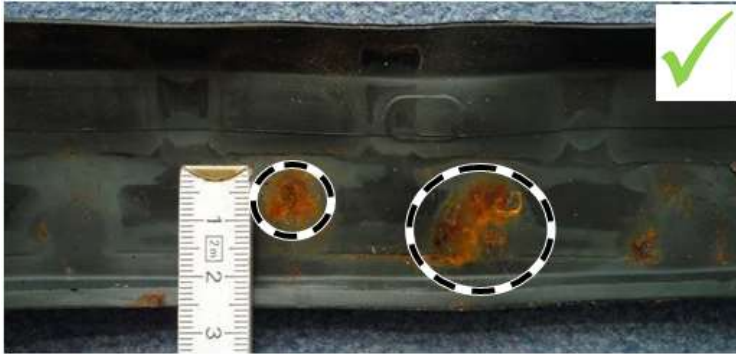
Figure 6 (OK)