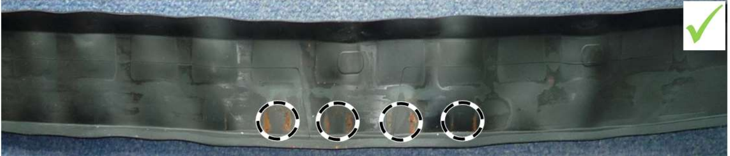
Figure 5 (OK)

A maximum of one point-shaped corrosion mark with a diameter greater than 15 mm (Figures 6 and 7) is permitted.