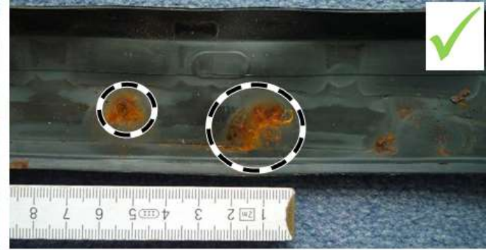
Figure 7 (OK)