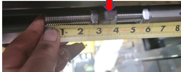
Figure 7: Rod end cylinder