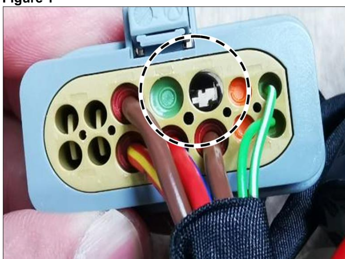
Figure 3 (not OK image)