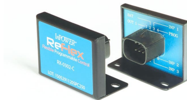
Replacement PTO Timer Module

It is the installer's responsibility to ensure all OEM chassis equipment, body and/or products are not damaged during set-up or installation.