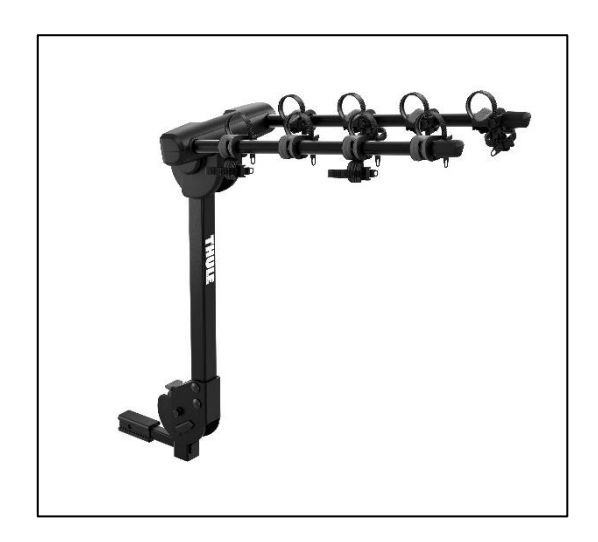
Thule Camber 4 bike 905600