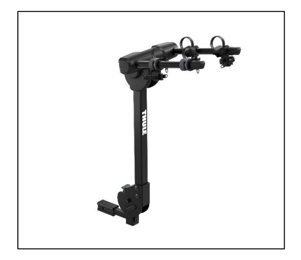
Thule Camber 2 bike 905800