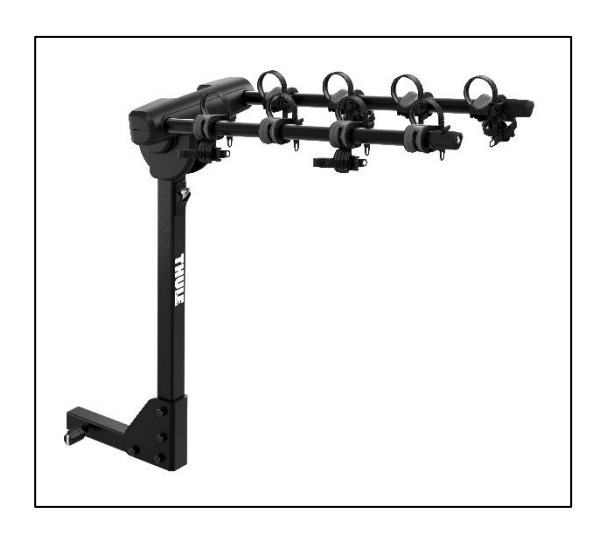
Thule Range 4 bike 905700