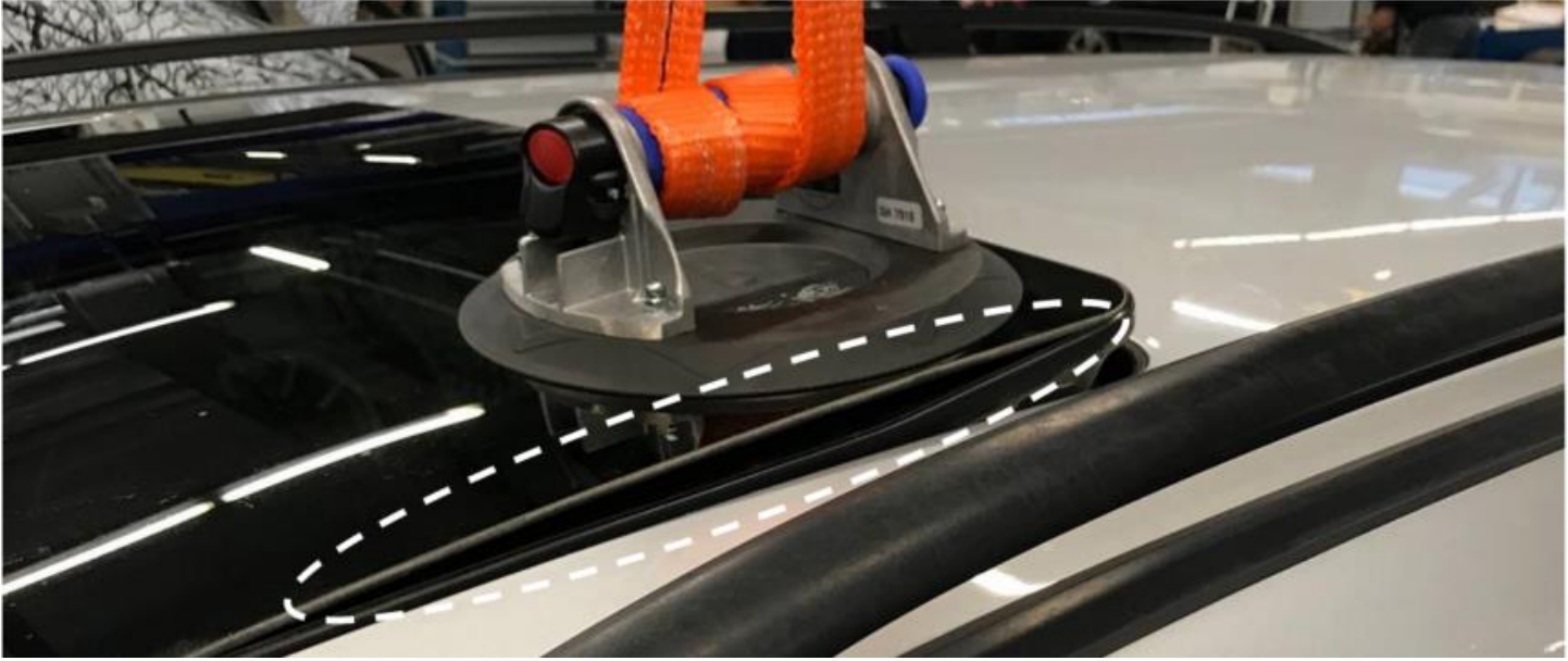
Figure 3, not OK (shown here on a sliding sunroof)

i If the panoramic sliding sunroof panel is detached from the padding of the sliding sunroof/ tilting roof frame at one of the test points (see Figure 3), replace the sliding sunroof panel.