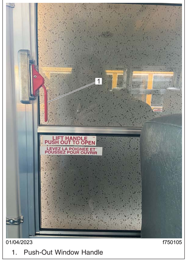
Fig. 5, Inspecting the Push-Out Window Handle Clearance