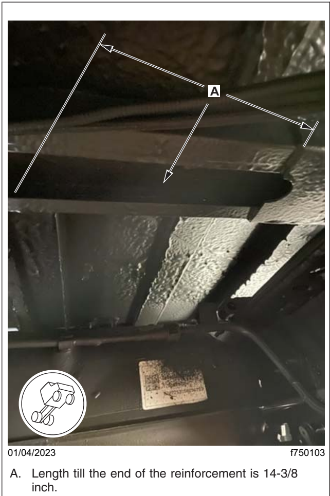
Fig. 3, Installing the Joist Reinforcement

Figure 4 shows the precise location of the reinforcement.