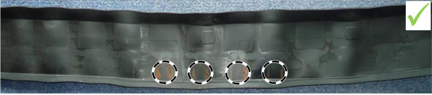
Figure 5 OK

A maximum of one point-shaped corrosion mark with a diameter greater than 15 mm (figures 6 and 7) is permitted.