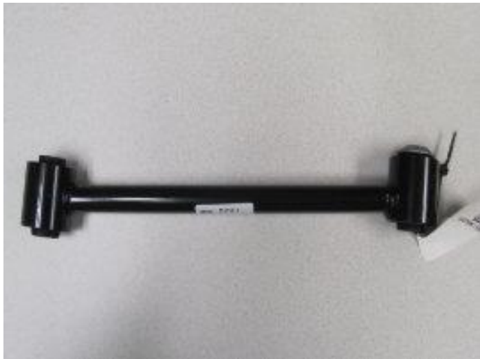
Over-mold service part