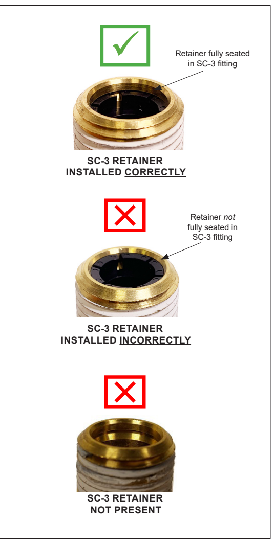
Figure 2 - SC-3 Single Check Valve Retainer (continued)