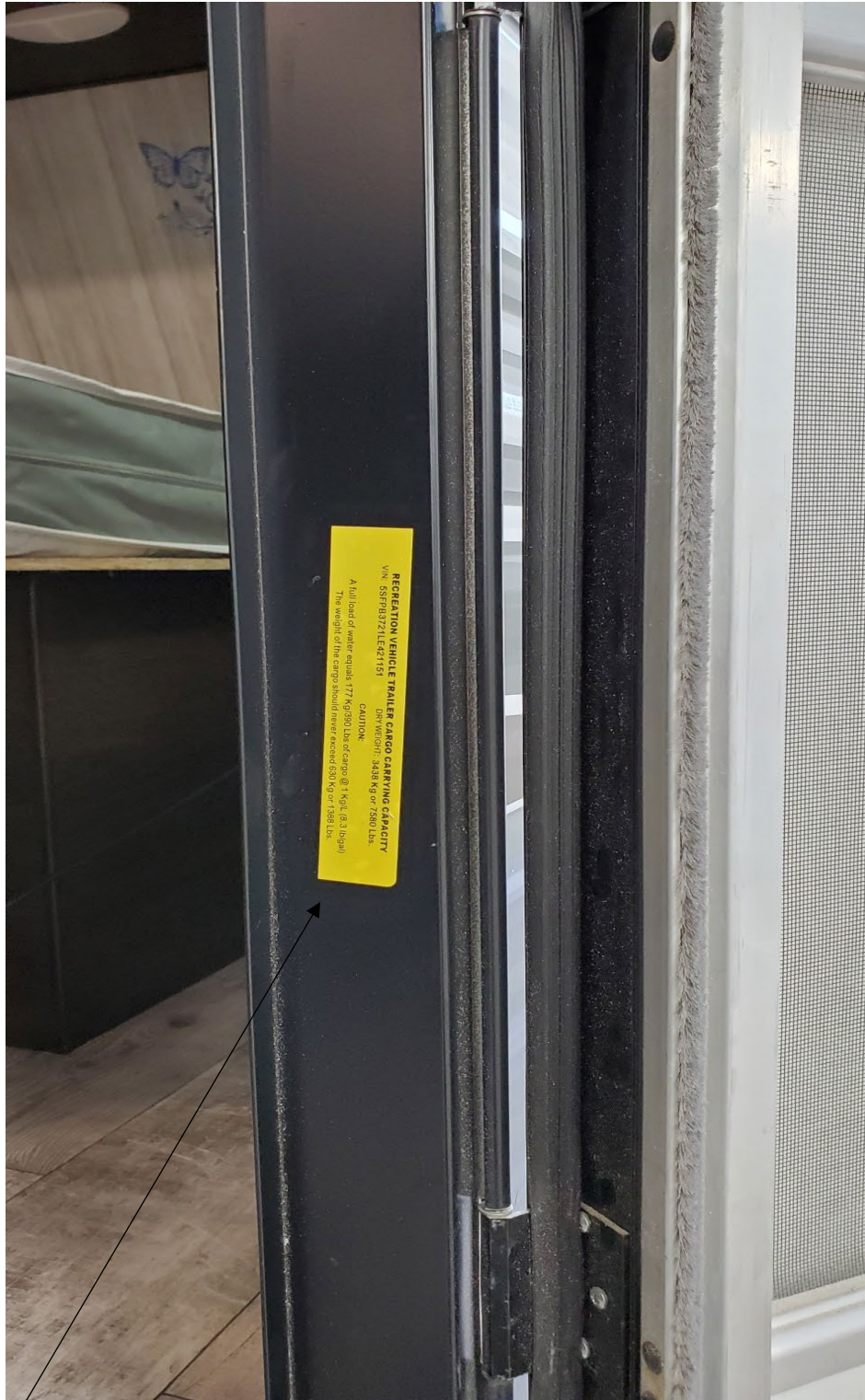
Section 3 – Cargo capacities applied to the inside of the door jamb.