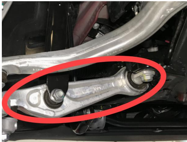
Figure 2 – LH shown ; RH similar