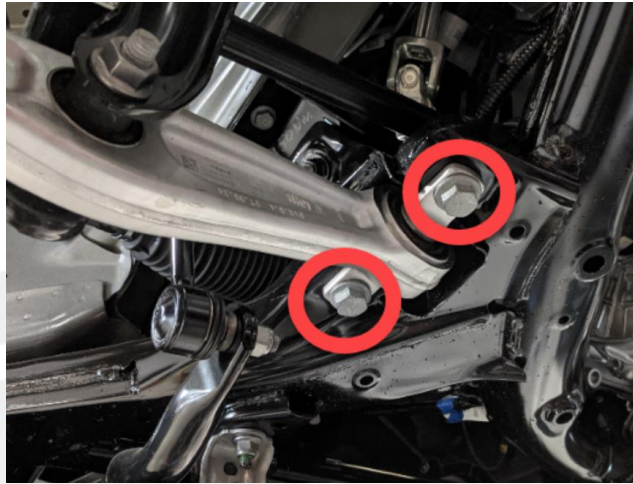
Figure 1 – LH shown; RH similar