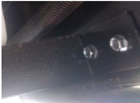
INSIDE OF I BEAM

STEP 1: IF THE TANK BAR OR BARS ARE MISSING SELF TAPPING SCREWS WITH NO EXCESS MOVEMENT OF THE TANK: SELF-TAPPING SCREWS NEED TO BE ADDED FROM THE INSIDE OF THE I BEAM, TO THE EXISTING UNUSED HOLES IN THE TANK BAR FLANGES. ONCE ADDED, THE SECUREMENT SHOULD APPEAR SIMILAR TO THE PICTURES.