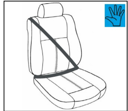
Closing three-point belt