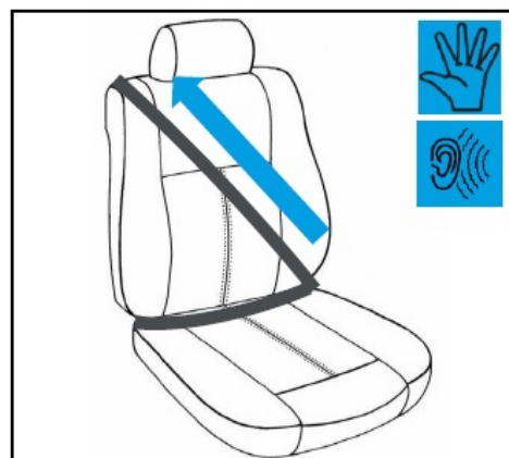
Retracting belt strap