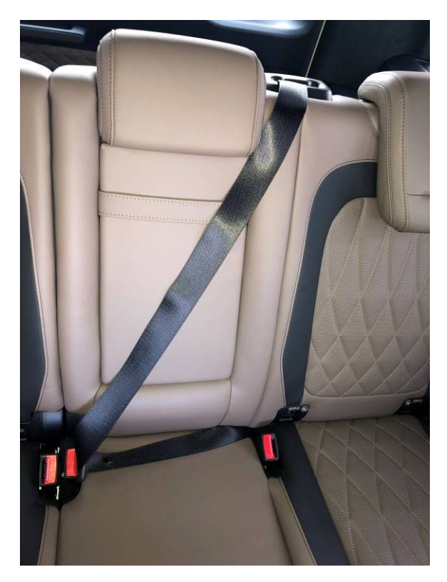
Figure 5, model 463

10. Pull the seat belt webbing until the entire length has been completely spooled out of the inertial reel, up to end stop.