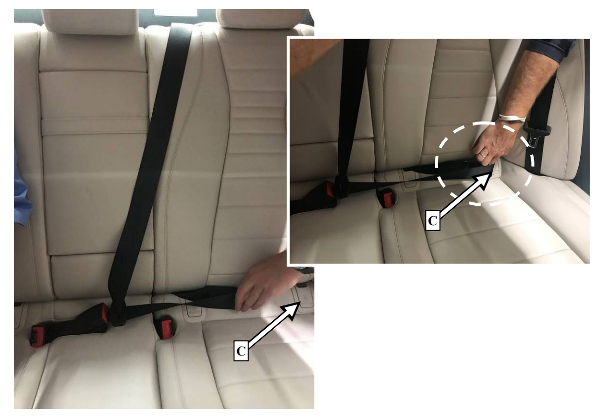
Figure 3, model 213

i Forming a loop is not required with model 463.