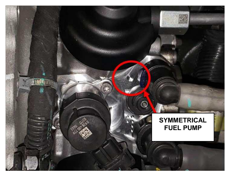
Figure 1 – Symmetrical Fuel Pump