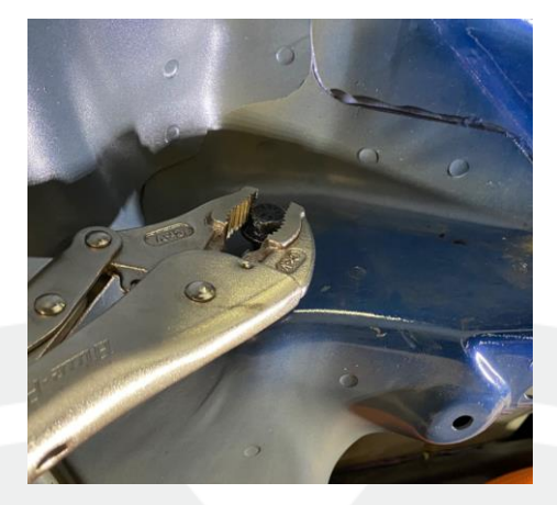
Figure 10 – LH shown; RH similar

IP: Use a deadblow hammer if unable to dislodge the weld nut with vise grips.