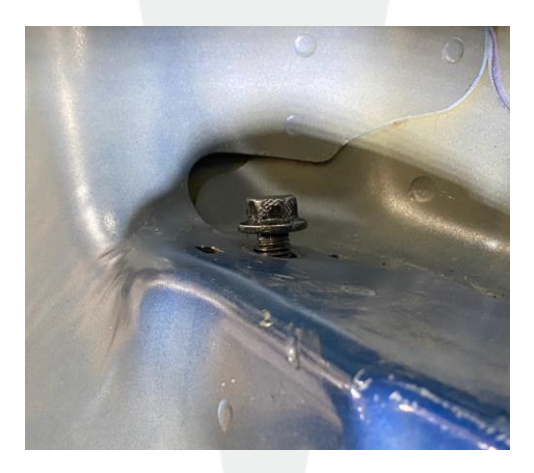
Figure 9 – LH shown; RH similar