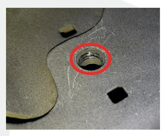
Figure 6 – LH shown; RH similar