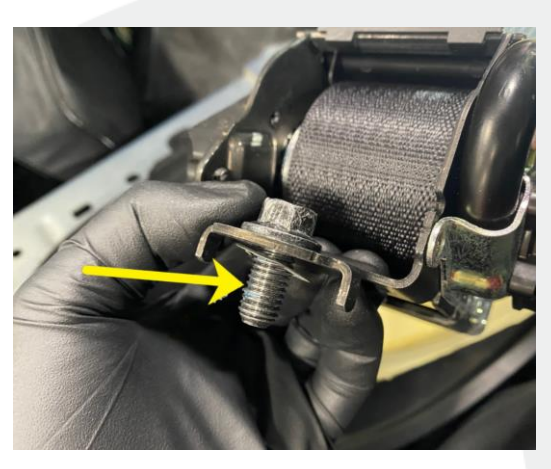
Figure 5 – LH shown; RH similar

6. Remove the LH 2<sup>nd</sup> row seatbelt retractor from the vehicle and inspect the retractor bolt (Figure 5) and weld nut threads (Figure 6).