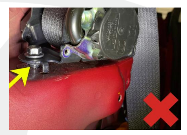
Figure 2 – LH shown; RH similar

4. Release the locking tab, and then disconnect the electrical harness from the LH 2<sup>nd</sup> row seatbelt retractor (Figure 3).