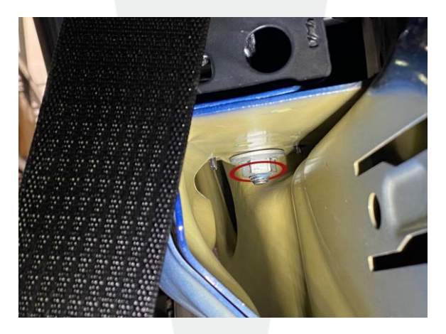
Figure 11 – LH shown; RH similar