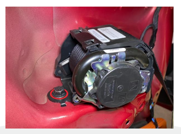
Figure 4 – LH shown; RH similar

5. Remove the bolt that attaches the LH 2<sup>nd</sup> row seatbelt retractor to the body (torque 30 Nm) (Figure 4).