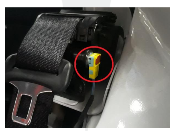
Figure 3 – LH shown; RH similar

4. Release the locking tab, and then disconnect the electrical harness from the LH 2<sup>nd</sup> row seatbelt retractor (Figure 3).