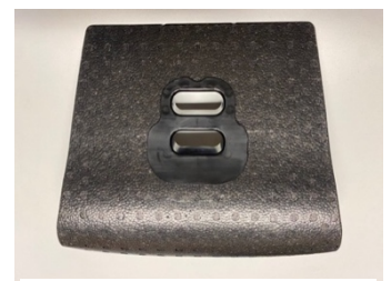
EPP foam seat cushion with plastic insert installed