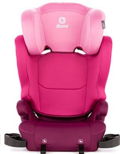
CAMBRIA 2 – PINK PRODUCT CODE – 31202-CA-01

When used with the back / headrest, these booster seats could exhibit a cracking or breakage of the headrest assembly during a severe frontal crash. The headrest could detach from the booster seat under these conditions, possibly causing injury to vehicle occupants. No injuries have been reported at the time of the submission.