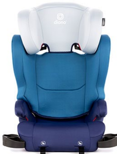
CAMBRIA 2 – BLUE PRODUCT CODE – 31201-CA-01