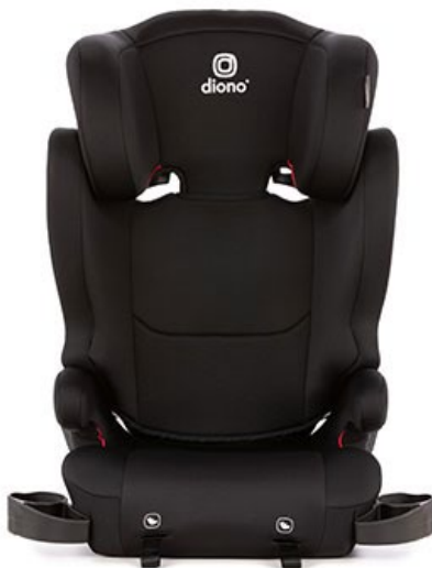
CAMBRIA 2 – BLACK PRODUCT CODE – 31200-CA-01

Subject: Diono Cambria 2 31200-US-01, 31201-US-01, and 31202-US-01