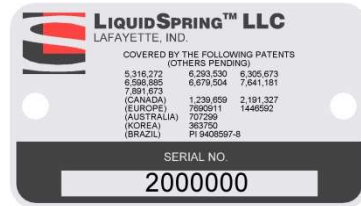
Figure 3. Serial Plate

If you have a 2019-20 model year RAM 4500/5500 cab chassis equipped with a LiquidSpring suspension system within the above serial number range, please contact Luxe Trucks dba Utility Bodywerks to arrange service to have the rear brake caliper flexible lines inspected and modified to address the potential wear issue, free of charge. This will take around 2 hours.