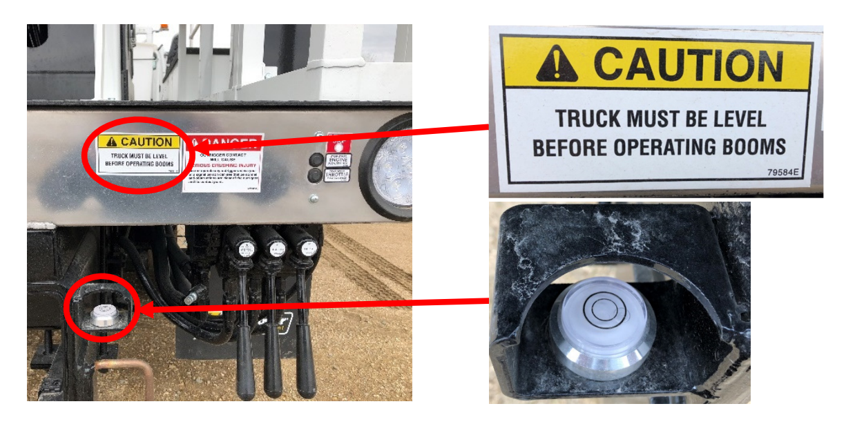
Figure 2. This bulletin does not apply if slope indicator and decal require the unit to be level.