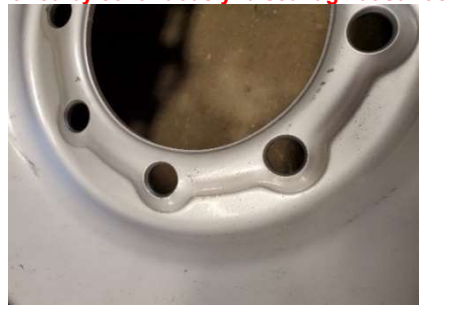
Defective Supplier Wheel Improper Lug Nut Seat and Potential Cracks Identified by continuously raised lug nut surface