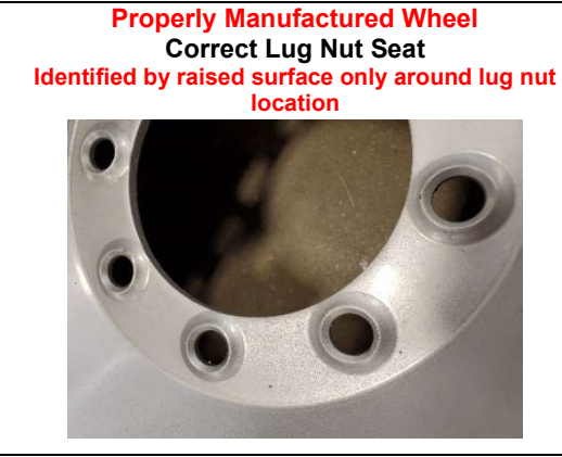
IMMEDIATE WHEEL INSPECTION REQUIRED

1. WHEEL AND LUG NUT INSPECTION. Inspect each brush chipper wheel by referencing the photos to identify if defective supplier wheels are installed. The Model and VIN is shown on the top right of this letter and the enclosed Wheel Lug Net Inspection form.