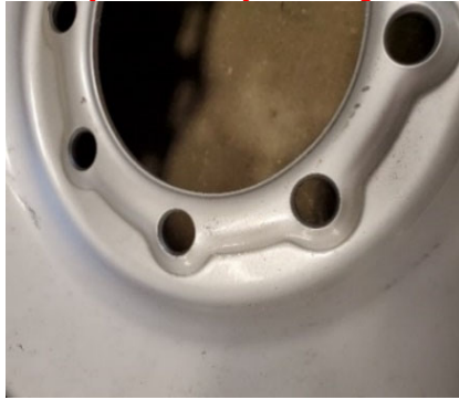
Defective supplier wheel Improper lug nut seat and potential cracks Identified by continuously raised lug nut surface