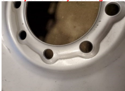
Defective Supplier Wheel Improper Lug Nut Seat and Potential Cracks Identified by continuously raised lug nut surface