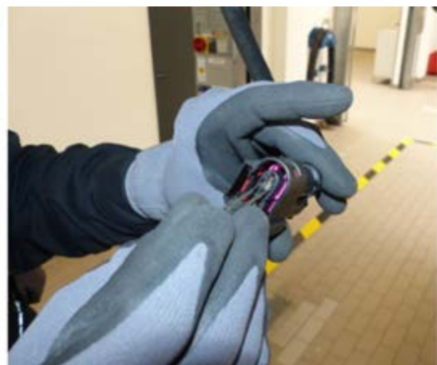
Figure 3 Figure 4