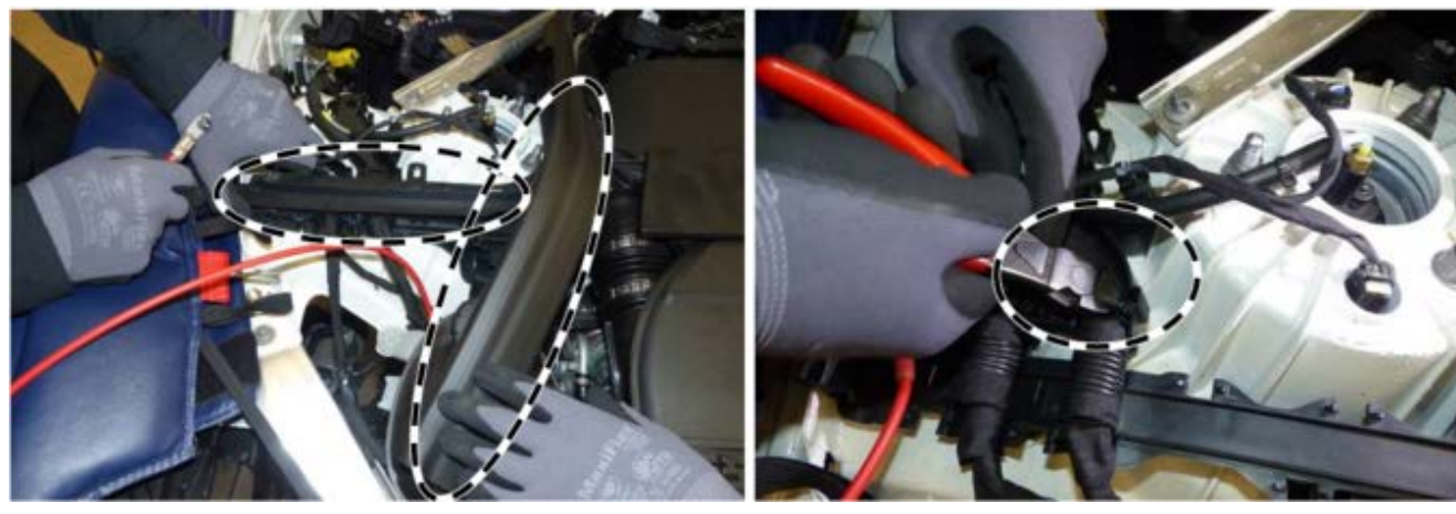
Figure 9 Figure 10