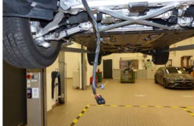
Figure 1 (Routing in cable duct)