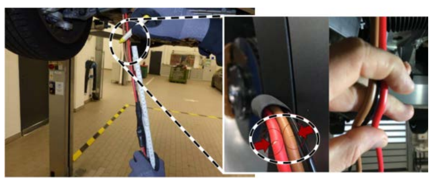
Figure 2 (NOT OK)