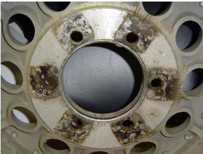
Fig. 1 Before Cleaning

Warning: Do not allow solvent or equivalent to make contact with the tire. Do not use liquid paint remover as this will pit and damage the aluminum wheel. Do not use a wire wheel (brush) or grinder to remove the paint from the wheel as this will also damage the wheel.