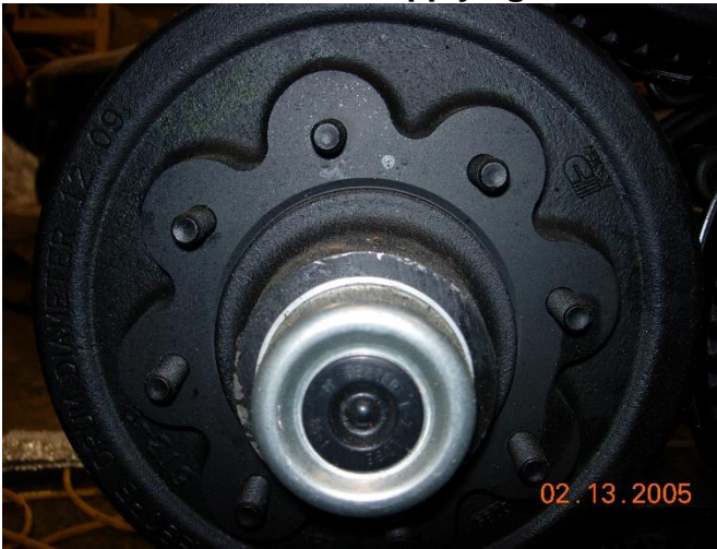
Fig. 3 Before Cleaning

Warning: When cleaning the hub face with the wire wheel brush avoid excessive pressure on the studs. Applying too much force here could damage the threads on the studs.