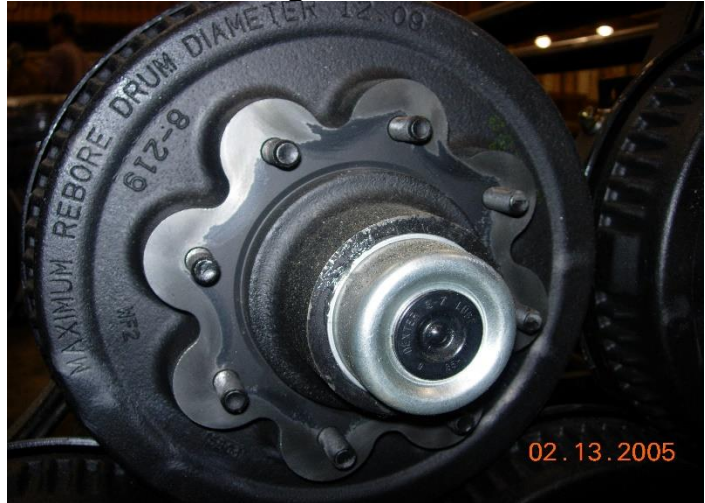
Fig. 4 After Cleaning