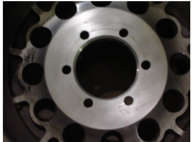
Fig. 2 After Cleaning