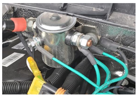
Original: 3-Post Solenoid