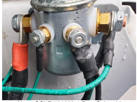
New: COLE #24059 4-Post Solenoid