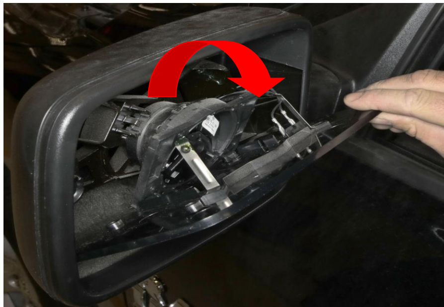
Figure 2 – Mirror Glass