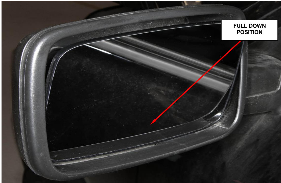
Figure 1 – Side View Mirror Assembly