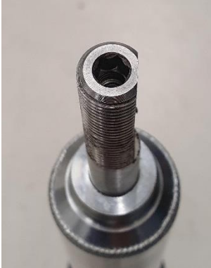
Recalled part no marking