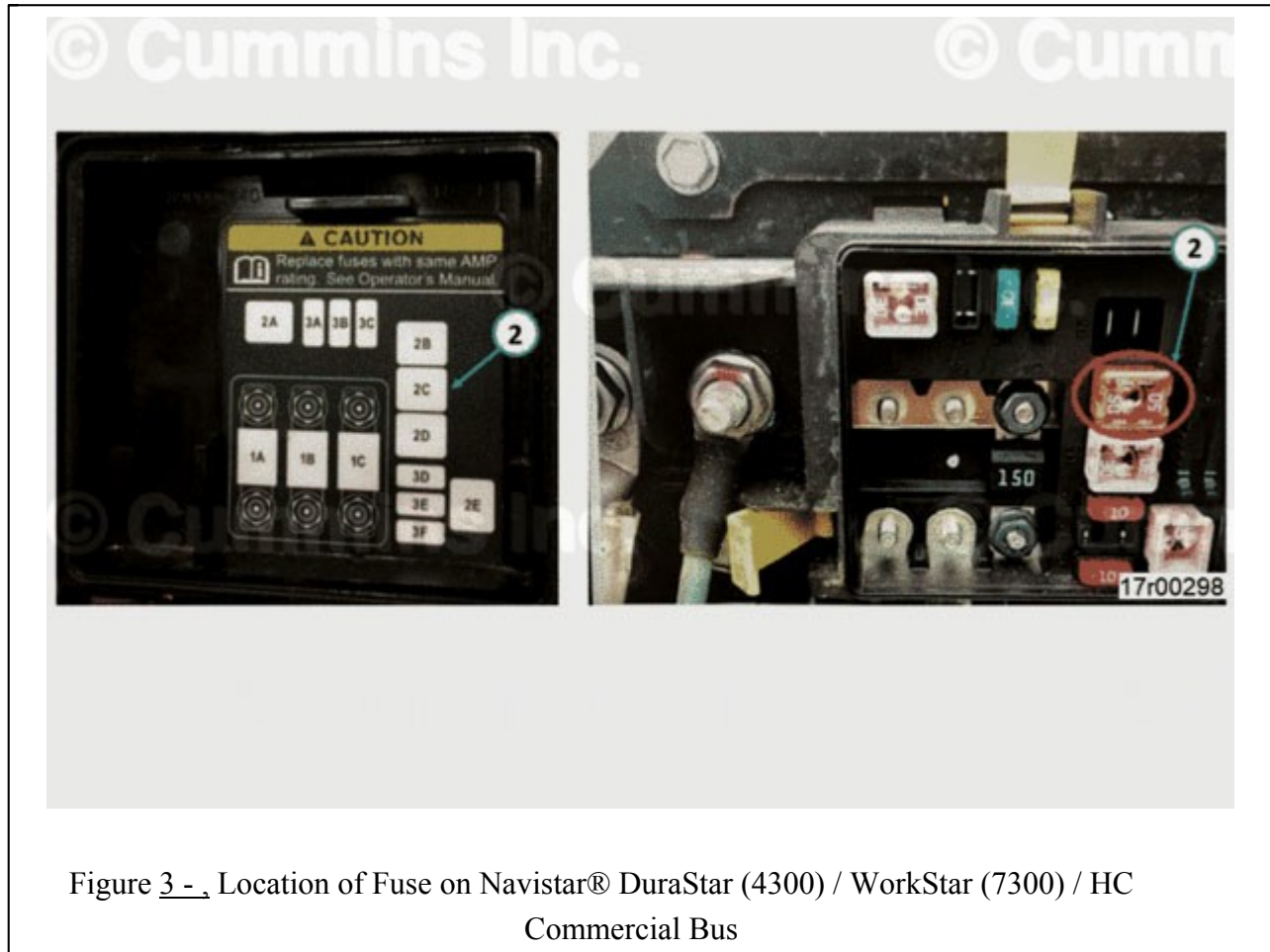
Figure 3 - Location of Fuse on Navistar® DuraStar (4300) / WorkStar (7300) / HC Commercial Bus