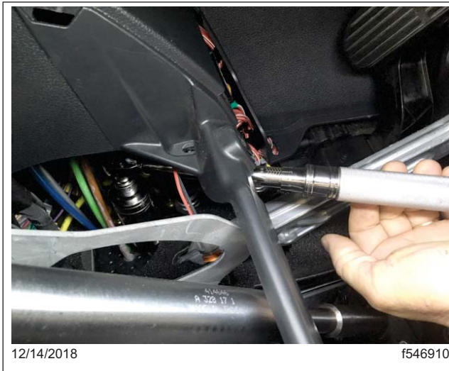
Fig. 2, Tightening the Brake Light Pressure Switch

5.1 Install the 2-pin pressure switch on vehicles in FL863A . Torque the switch 7 to 9 lbf·ft (9.5 to 12 N.m) See Fig. 2 .