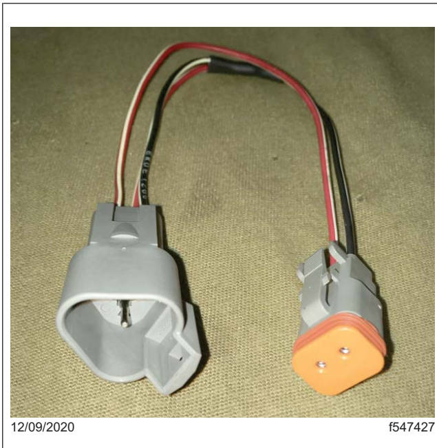
Fig. 3, Jumper Harness