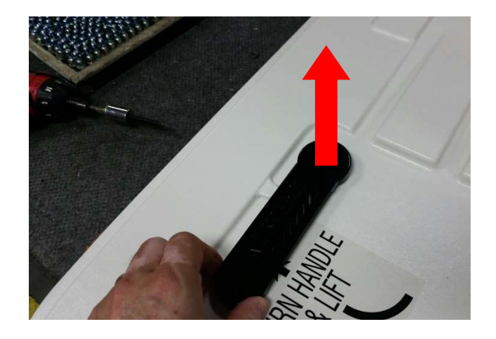
Step 8: Open the lid 5-6 inches, reach around and lift the black handle out of the bushing.