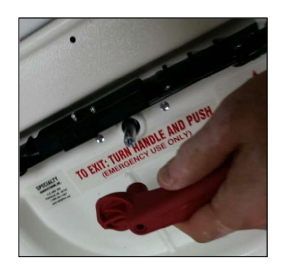
Step 7: Pull down to remove the red handle