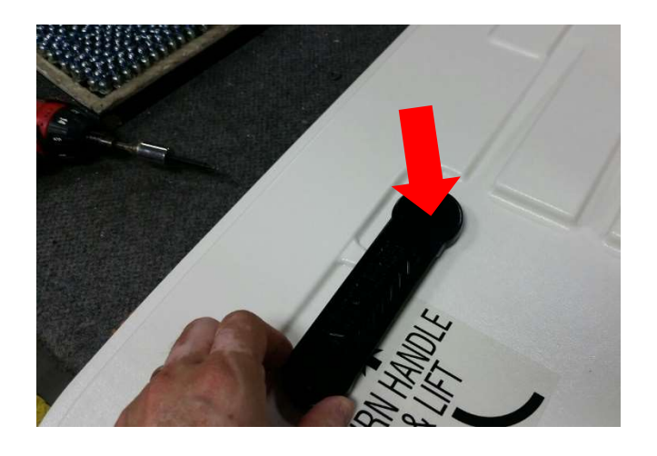
Step 11: Insert the new handle into the bushing and orient as shown.