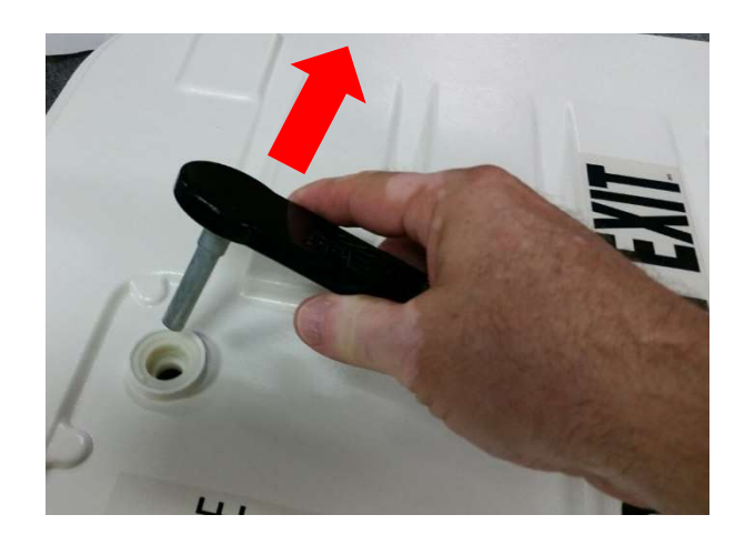
Step 9: Remove outer handle

Control No: W-HAT-180 Content Revision: - Draft Dept: PROLO HATCH Page 3