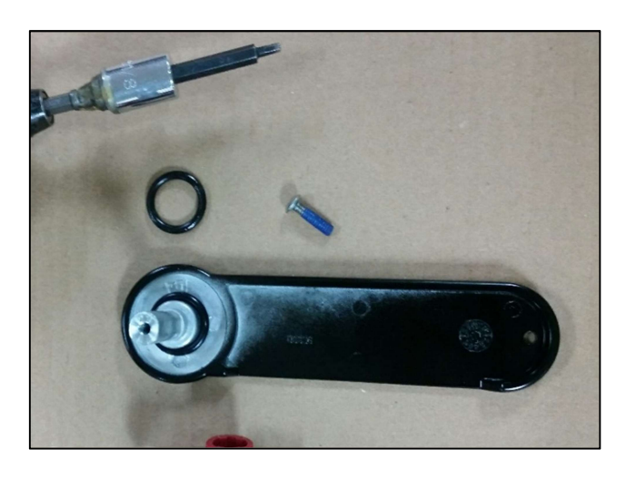
Step 1: Gather the necessary components for the work. 009336 Handle, 009321-5 O-ring, 008798 Screw, 1/8" Allen wrench or driver w/ 1/8" bit