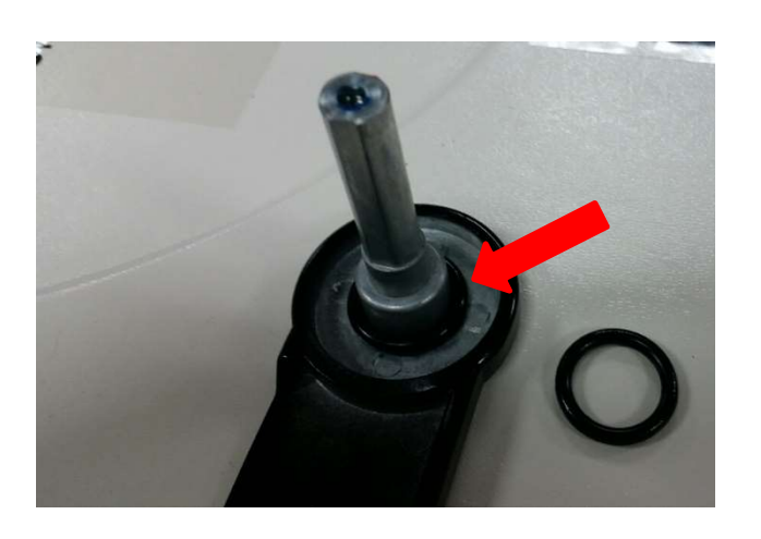
Step 10: Ensure that the 009321-5 Oring is secured around the base of the handle stem. If it is not there, check to see if it is in the lid bushing. If it is not in either location, replace with a new o-ring.