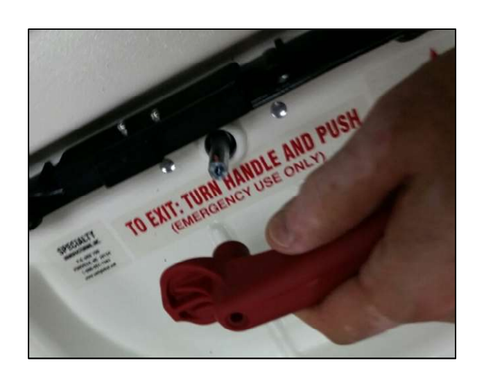
Step 13: The inside of the red handle has ribs to self-orient the red handle on the outer handle.