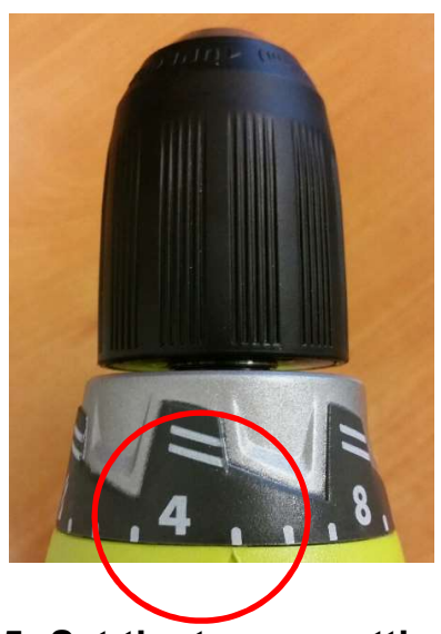
Step 5: Set the torque setting to 4-5, or the minimum needed to set the screw.

Control No: W-HAT-180 Content Revision: - Draft Dept: PROLO HATCH Page 2