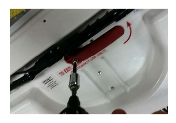
Step 14: Place the handle onto the stem of the outer handle (oriented as shown).