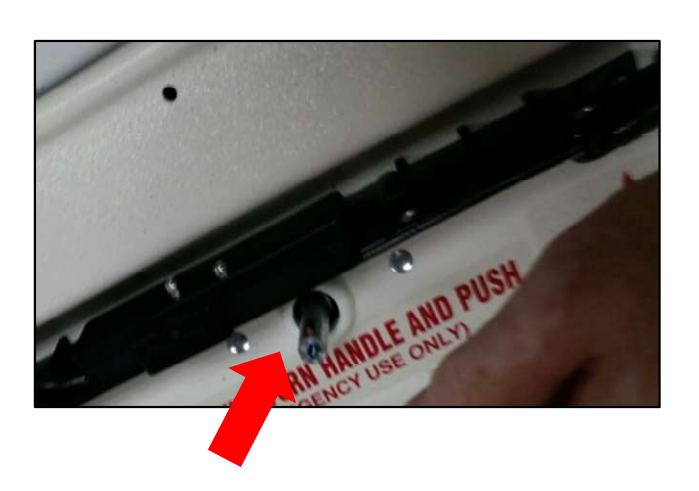
Step 12: From inside the lid, you will see the shaft of the outer handle