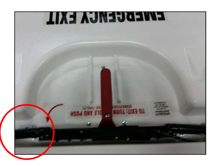
Step 2. Locate the silver "build date" sticker on the inside of the lid (located in red circle shown above)