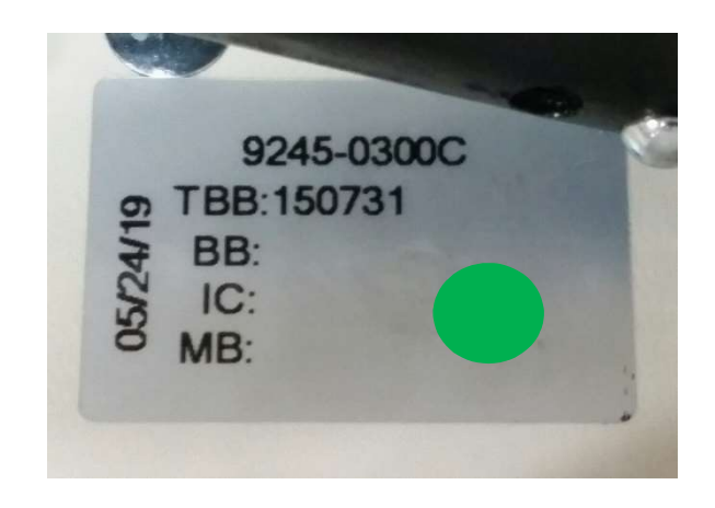
Step 18: When the rework is complete, place a green sticker on the silver sticker.

Step 19: Close the lid from the vented position. The rework is complete. Move to the other hatch in the bus.