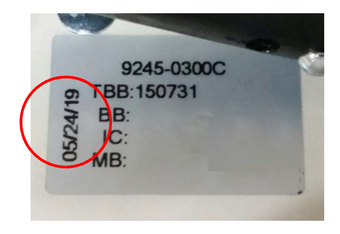
Step 3: If the date is between 8-1-18 and 5-21-19, the hatch will need to be reworked. Dates before or after that timeframe do not need rework.