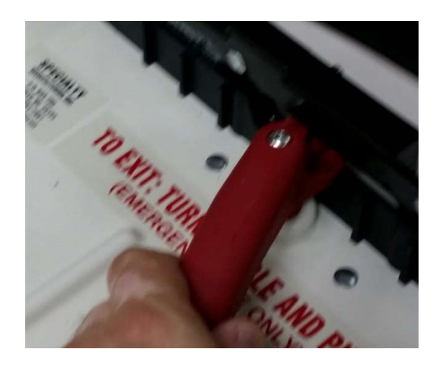
Step 17: Secure the lid to the trim subassembly by rotating the handle into position. There should be a "click" when the switch is activated. If a switch does not occur, the switch will need to be replaced.

Control No: W-HAT-180 Content Revision: – Draft Dept: PROLO HATCH Page 5