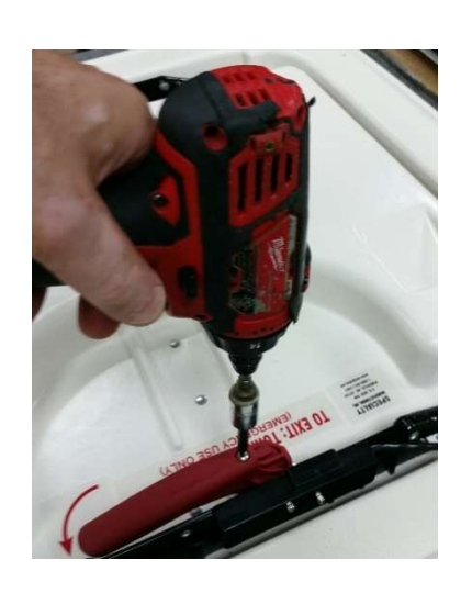
Step 6: Insert the 1/8" Allen bit into the 008798 screw and remove screw from red handle.