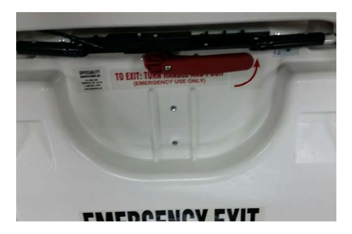
Step 4: REWORKINGTHE HATCH Rotate the handle into the orientation shown