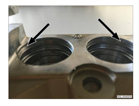
Figure 2: Base of the groove (arrows) of the front dust scraper ring without corrosion