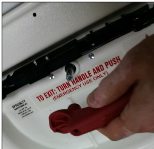
Step 7: Pull down to remove the red handle