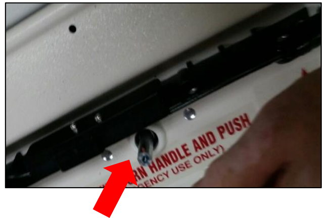
Step 12: From inside the lid, you will see the shaft of the outer handle