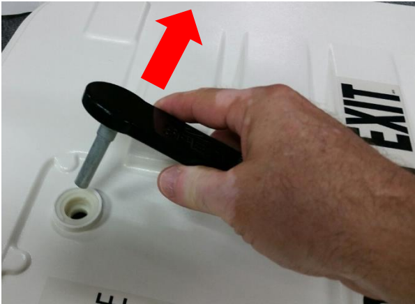
Step 9: Remove outer handle