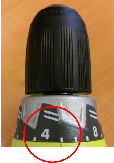
Step 5: Set the torque setting to 4-5, or the minimum needed to set the screw.