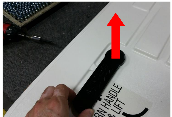
Step 8: Open the lid 5-6 inches, reach around and lift the black handle out of the bushing.