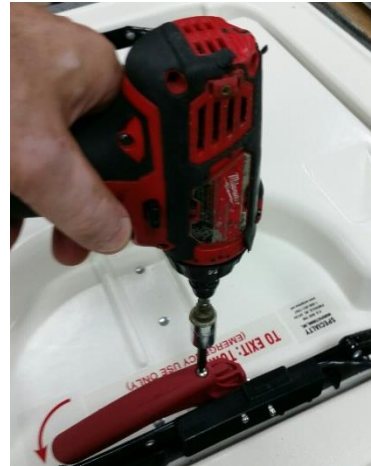
Step 6: Insert the 1/8" Allen bit into the 008798 screw and remove screw from red handle.