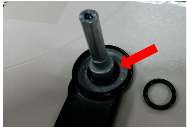
Step 10: Ensure that the 009321-5 O-ring is secured around the base of the handle stem. If it is not there, check to see if it is in the lid bushing. If it is not in either location, replace with a new o-ring.