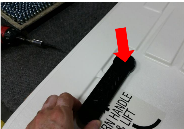
Step 11: Insert the new handle into the bushing and orient as shown.