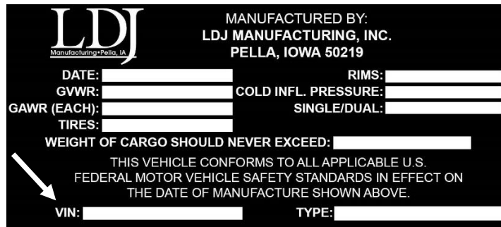
VIN number tag

Issue Description: The wheel center caps on affected trailers could cause the wheels to come off the trailer.