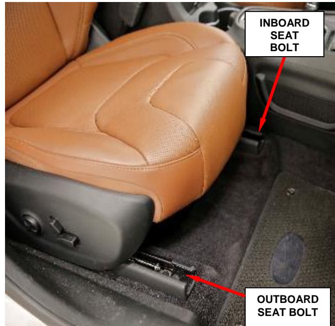
Figure 1 – Check Front Seat Bolt Torque