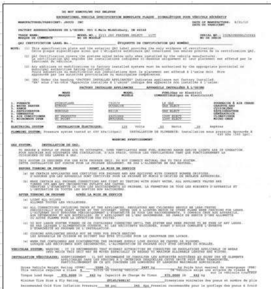
Example CSA Data Sheet