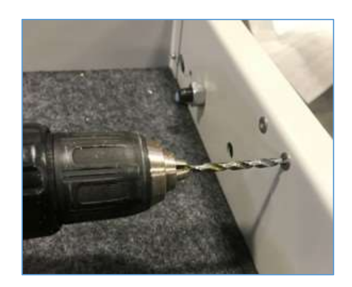
Chose one method of Repair - 2A or 2B