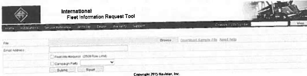
Figure 1. Fleet Information Request Tool