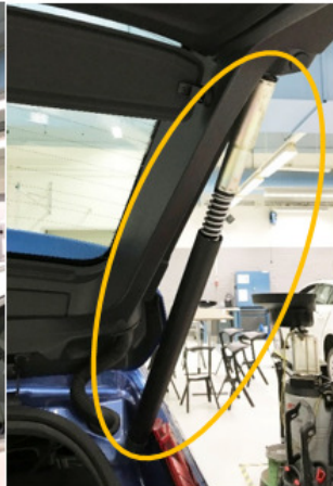
Condition 2, Not OK