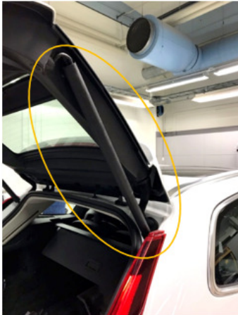
Condition 1, OK