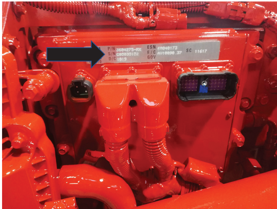
Figure 4 – Location of the ECM serial number on the remanufactured engines.

If you find any ECMs having a serial number with a prefix of A or B on the Recon Engines, follow the instructions in Safety Campaign #C2253 "ISX CM871 Engine Control Module Safety Campaign".