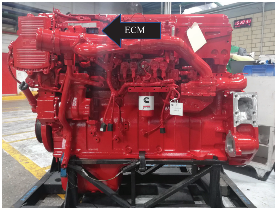
Figure 3 – Location of ECM on Engine