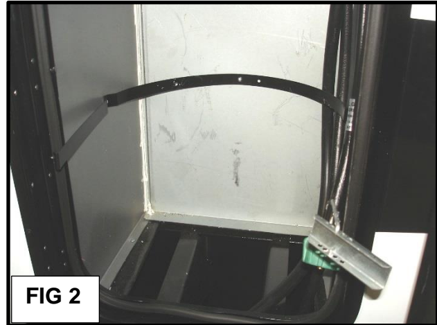
Fig 1: Turn off LP at tank. Disconnect the LP hose from the tank. Unfasten the tank strap/s, and remove the tank from the compartment. Fig 2: Replace each strap with a new one from the Recall Parts Kit.

NOTE: A 2" section that includes the buckle of the defective strap must be returned to Dexter.