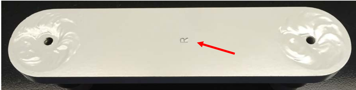
Reworked stamped R, B, or four stamped letters