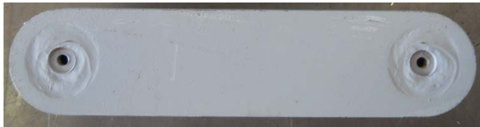
Zerk counterbored on bar side