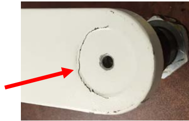
Figure 1 - Example of a crack