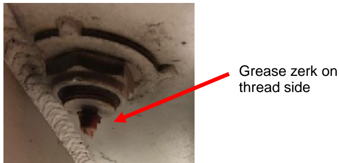
Grease zerk on thread side