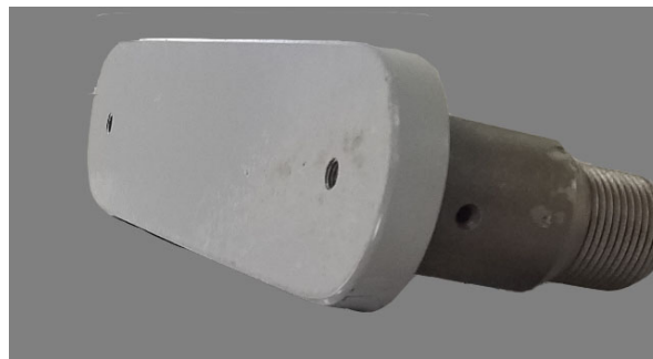
Zerk flush to top surface