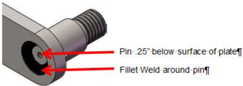
Fillet weld around recessed pin