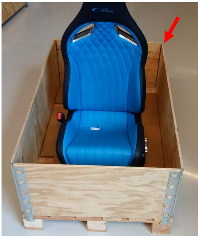
1 seat packaging