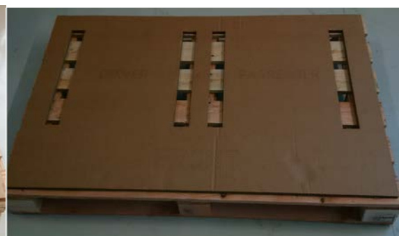
2 seats packaging