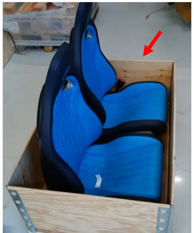
2 seats packaging