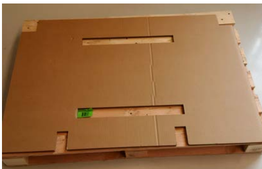
1 seat packaging